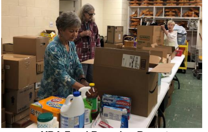
YBA Food Roundup Report

THANK YOU to each and every one who helped to make this year's BCH Food Roundup such a success. A truck load of food and other needed items along with gift cards and financial donations were delivered to the Cameron Boy's Camp.