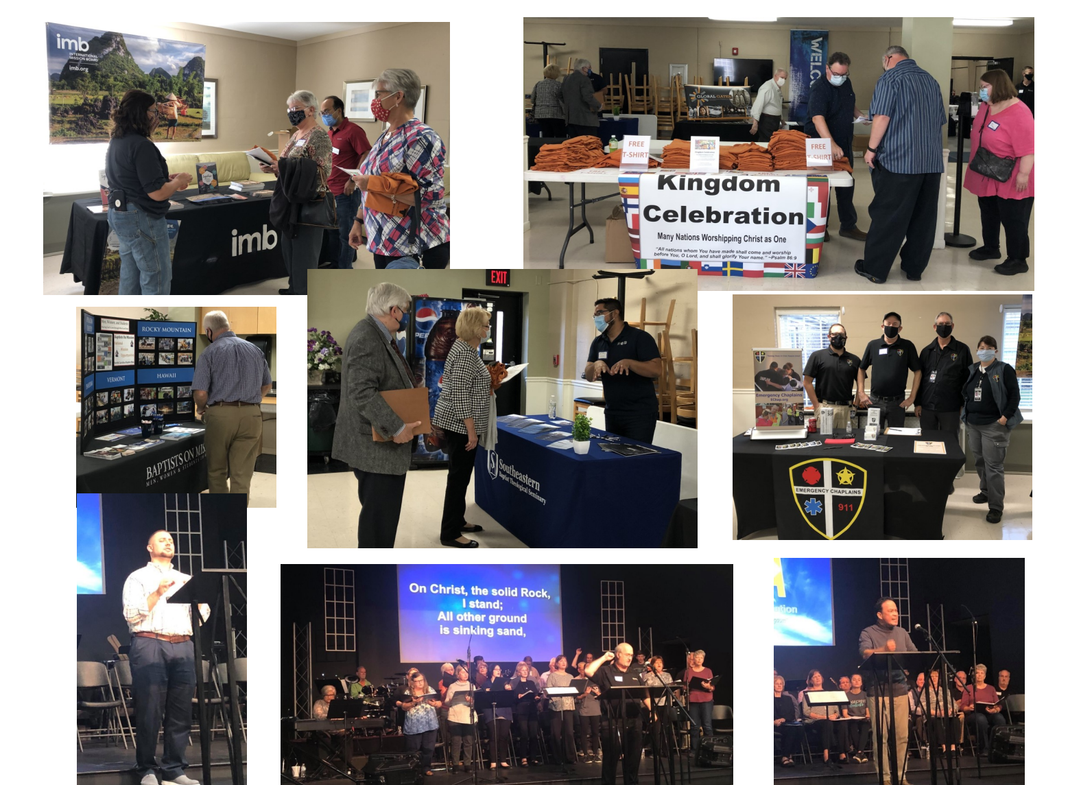
A special thanks to Ridgecrest Baptist Church for hosting this event.